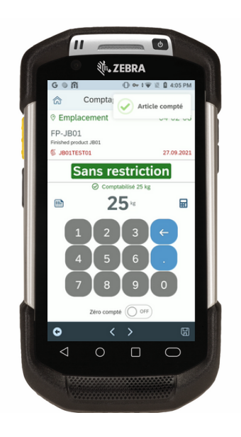
HRC Warehouse - Track your inventory management in real time, via a fluid and intuitive interface

HRC Software's mobile application solutions guide your operators during all their daily activities for your Supply Chain, Maintenance and Procurement processes, all integrated into your SAP ECC6 & S/4 system. Installed in just 48 hours, they are designed for industrial contexts, taking into account the environmental constraints of your users. Intended for warehouse workers and forklift operators, or even store managers, they allow you to optimize your physical flows and boost your operational performance.